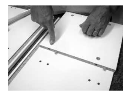
CAUTION: The arrow must be facing the hole

PUT THE QUARTER TURNS CAMLOCK INSERTS INTO THE TOP, BOTTOM AND MIDDLE SHELF